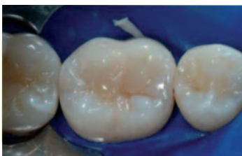
Clinical case by Camillo D'Arcangelo