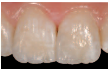
Clinical case di Lorenzo Vanini